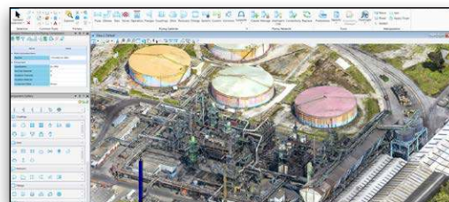
Details of components can be easily seen in a grid view.