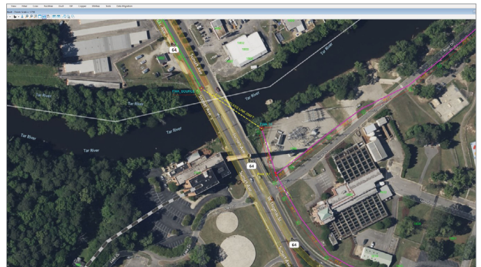
OpenComms Designer interfaces and integrates with a variety of WMSs to streamline the process of managing projects from inception to completion.

OpenComms Designer provides you with an easy-to-use graphical user interface (GUI) for specifying equipment, drawing, and engineering standards used in the design and documentation of your fiber, coax, and hybrid fiber-coax networks, which includes a preconfigured library for quick startup.